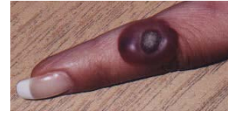
Liquid Nitrogen Burn