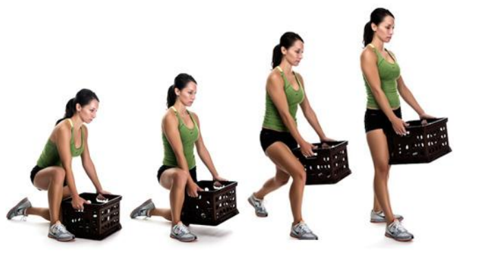
Move Close Firm Grip