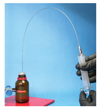
Fig. 9 Removing gas bubbles and returning excess reagent to the Sure/Seal bottle