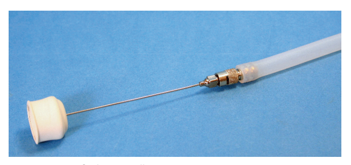
Fig. 2. Nitrogen-flushing needle

Small quantities (up to 50 mL) of air-sensitive reagents and dry solvents may be transferred with a syringe equipped with a 1-2 ft long needle. These needles are used to avoid having to tip reagent bottles and storage flasks. Tipping often causes the liquid to come in contact with the septum causing swelling and deterioration of the septa, and should therefore be avoided.