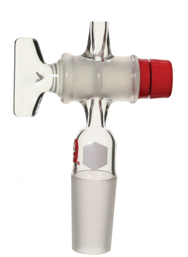
Fig. 5 Septum inlet adapter