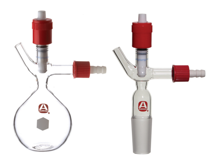
Fig. 14 Aldrich Sure/Stor™ flask