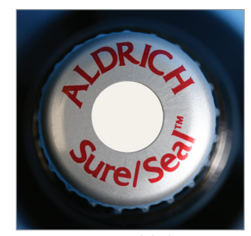
Fig. 1 Crown cap with hole

The polypropylene cap on a Sure/Seal bottle can be safely removed because the crown cap and liner are already crimped in place. The reagent can then be dispensed using a syringe or double-tipped needle inserted through the hole in the metal cap ( Fig.1 ). We recommend only smallgauge needles (no larger than 18-gauge) be used and the polypropylene cap be