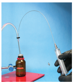
Fig. 8 Filling syringe using nitrogen pressure