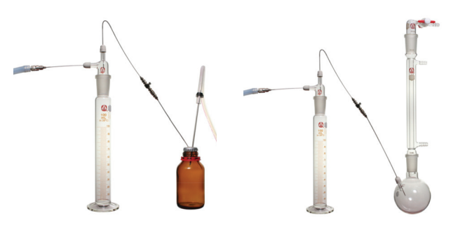
Fig. 13 Double-ended needle transfer with syringe valve